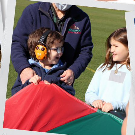
Elementary students with and without disabilities had fun together in the Special Olympics' Young Athletes sports program