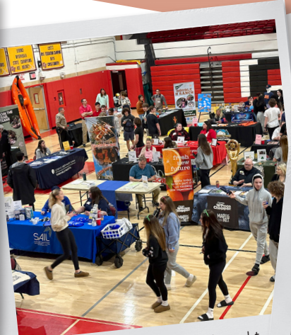
GFHS' Job Fair and Career Expo brought 35 employers into the gym, and 12 local business leaders into classroom talks