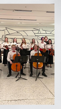
s performed on the Empire Irse for Music in our Schools