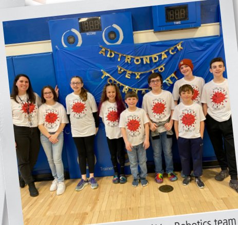
The Middle School's inaugural Vex Robotics team competed in the State championships, and won the Judges Award at Regionals in March